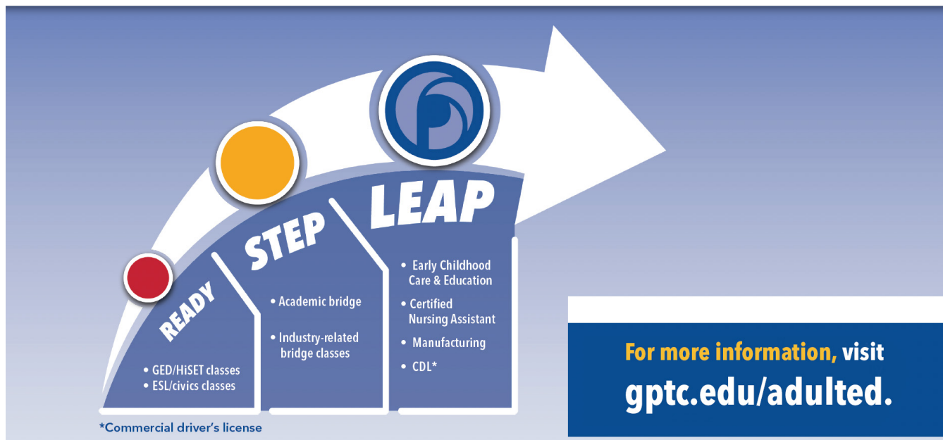
Figure 1. GPTC student pathway: Ready? Step. LEAP! (2023). Georgia Piedmont Technical College. https://www.gptc.edu/adult-education/truist-grant-career-pathways/ . Reprinted with permission.