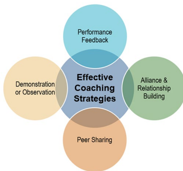
Exhibit 1. Effective Coaching Strategies

Performance feedback. Providing performance feedback is a critical coaching strategy that allows the coach to analyze and present information and data to support teachers in validating and/or enhancing their practice. Performance feedback could include on-site visit observations of teaching with time to debrief afterward about elements that worked or might need enhancement. Performance feedback includes feedback to teachers when meeting on site-visits, and talking virtually. Feedback can be about the implementation of the toolkit’s lesson plans, instructional approach or other observations. Feedback is also needed to review the pace of progress, accomplishment of work-plan goals, ability to work out challenges, or to identify and problem-solve issues or