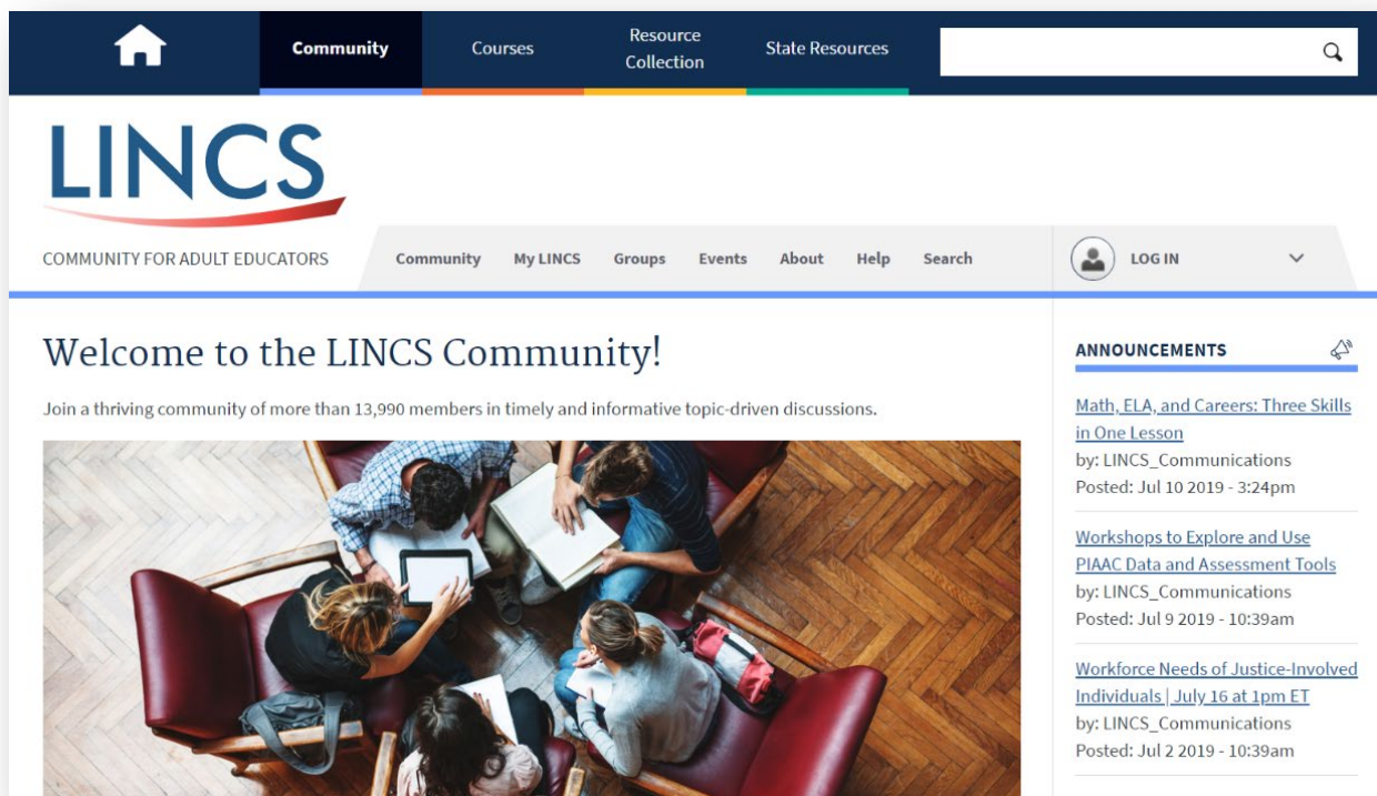
Exhibit 5. The LINCS Community site

In tandem with the goals of the LINCS Community as just outlined, the TSTM coaches will have the opportunity to collaborate and problem-solve with one another about their coaching experiences.